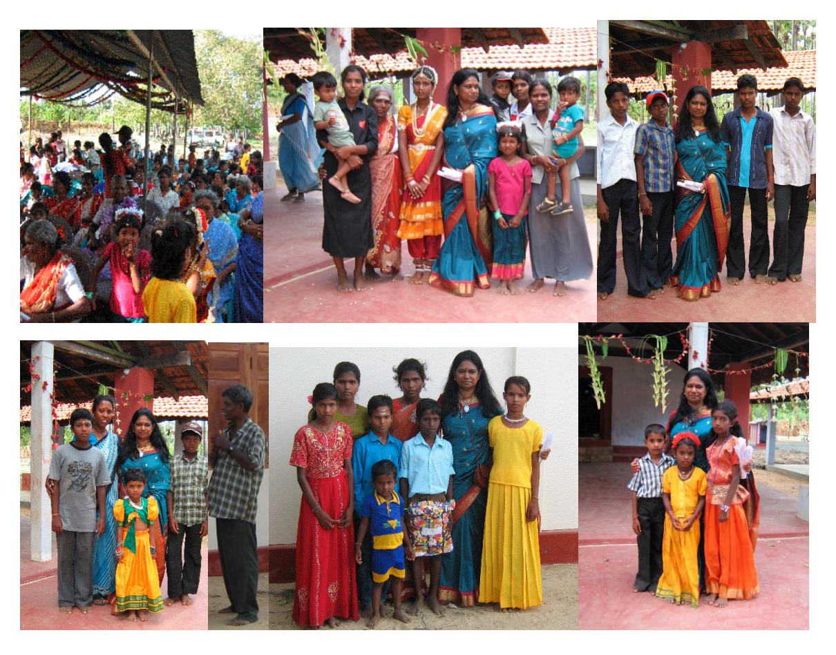
Local folks happily participated in the celebrations and many took the opportunity to express specific appreciation to the person through whom they primarily related to the development work. We felt that it was an opportunity for them to self assess and know the value of the development work.